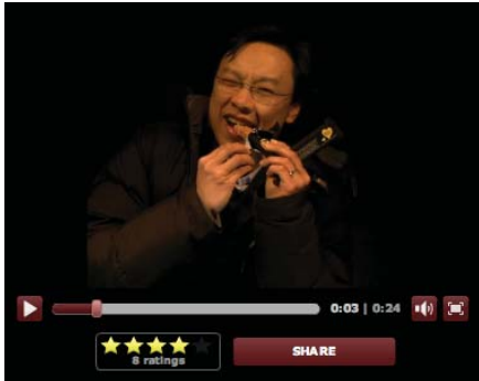
Did he love it or hate it? See the result on page 4.