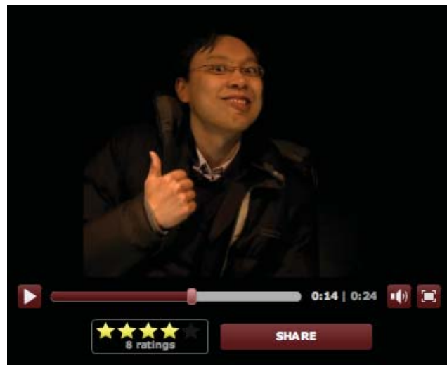
He loved it!

Since the start of the campaign, which went live at the beginning of March, up to 50 video clips have been uploaded simultaneously to the Facebook campaign page. In total, over 2,600 video clips have been posted to the site. According to Freshwater, platforms like Kyte are the future of digital marketing: He added: “For an agency such as AKQA using this volume of video content in an online campaign can be complex and time consuming. But with Kyte’s solution it’s possible to use a unified platform to efficiently manage large amounts of consumer content, and deliver the consumer interaction that’s so critical for success.”