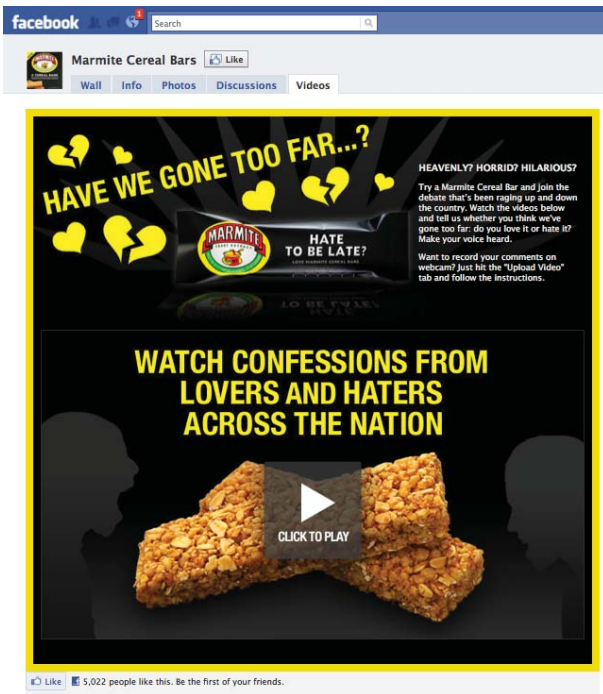
Marmite Cereal Bars Campaign Canvas Page

Since the launch of the innovative campaign in March 2010, the Marmite Cereal Bar Facebook group has already won 5,000 members, who either “love it or hate it”. Thousands of comments have been posted on the site, both about the videos and the cereal bar product. The use of the Kyte platform has further facilitated the interactivity that AKQA was aiming to stimulate through the campaign, by enabling members to vote for and see the most popular videos using Kyte’s rating functionality.